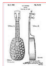
Kamaka's pineapple 'ukulele patent from 1928. The name was a pun on the Dole trademark for 'Ukulele Brand Pineapple.

About that makeover: Woodworkers did a brisk business in Madeira, making furniture, cabinets and curios, as well as stringed instruments. They knew their stuff, and why not— madeira means wood in Portuguese—but there was one kind of wood they didn't have: koa. Acacia koa Gray , sometimes called Hawaiian mahogany, had been revered for centuries by Native Hawaiians, who used it for their canoes and calabashes. Prized for its deep red color, curly grain and capacity to take a high polish, it was—is—arguably the most beautiful wood in the world, and grows only in Hawai'i. Garbed in Hawaiian koa, the little machete took on a whole new luster. Today, a 1930s-vintage Martin 5K ukulele (K for koa)—the “holy grail” of ukedom—will set you back about $10K, if you can find one for sale.