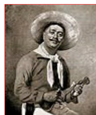
Kolomona, the Hawaiian Troubadour, was painted by Hubert Vos in 1898

The little twanger has a voice and, yes, indeed, it sings